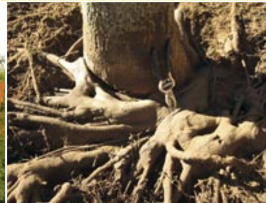
Air spade reveals serious root deformity