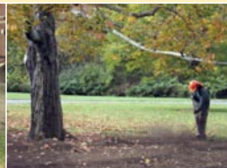
Integrating compost to rejuvenate root zone