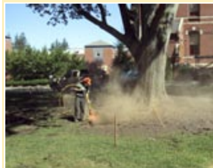
Breaking up compacted turf/soil